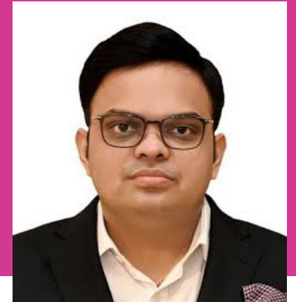
Jay Shah President Asian Cricket Council

"It is with great enthusiasm that I welcome you to the Women's Asia Cup 2024, set in the historic city of Dambulla, Sri Lanka.